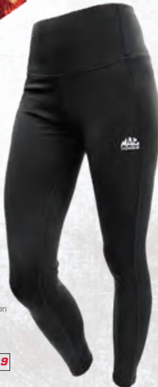
WOMEN'S EVERYDAY LEGGING