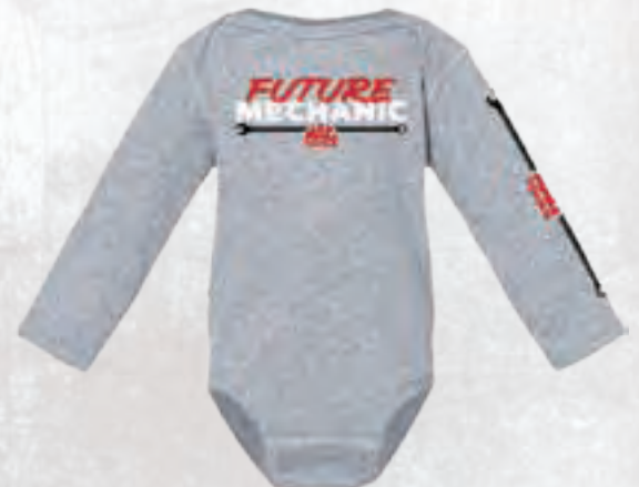
FUTURE MECHANIC ONESIE